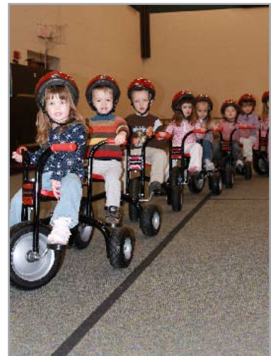
The preschoolers enjoyed the new trikes purchased from the $3,000 grant from Child Care Resource and Referral of Central Iowa.